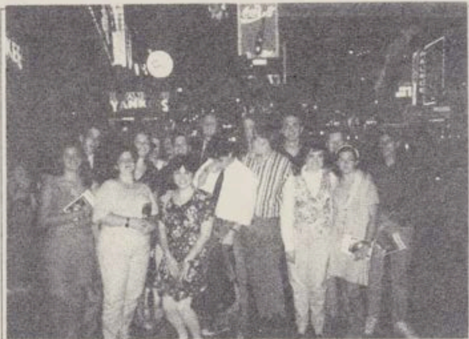
Thespians enjoy an evening on Times Square.

Day 5: Our last day in New York was spent in Greenwich Village, Soho, and Central Park. After that we stopped at FAO Schwartz, a three story toy store. The trip to the airport was an interesting one. Our bus driver was a bit odd. We were not sure if we would make it to the airport alive. When we did arrive they