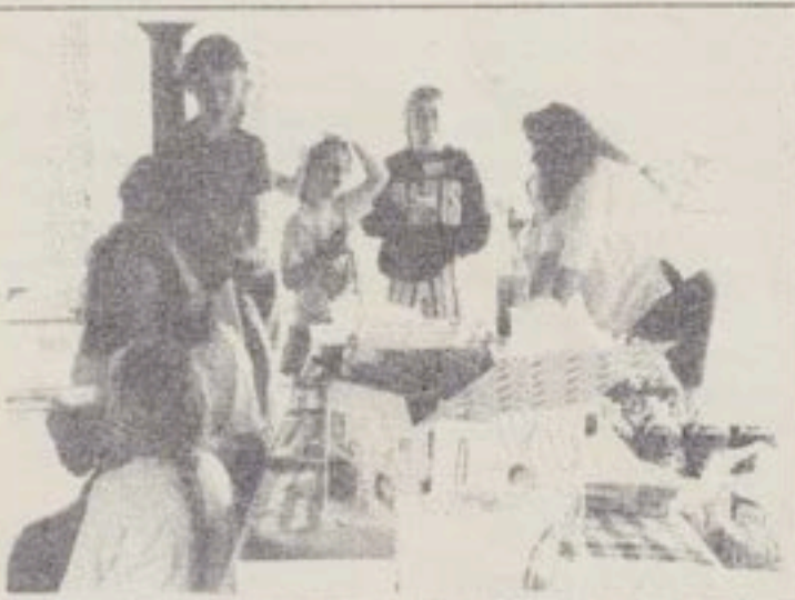
The White Hats enjoying last years picnic

Students are assigned to an "at risk" child to be that child's big brother or sister for as long as they are in high school. They help the children by tutoring, giving advice, and reassuring them to stay in school. Students can go visit the children during study halls or after school. The program builds a closeness between the student and child. Their sole purpose is to keep the children in school. "Students who are freshmen are assigned to a child for four years, which builds the relationship." Replied