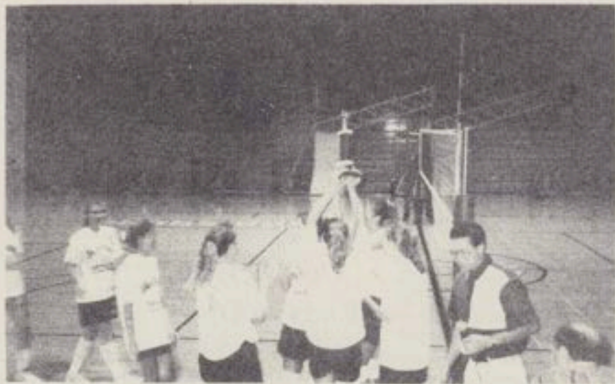
Lady Dogs take third place trophy in the Harrisburg Invitational.

Benton prevailed in a tough match Thursday the sixth in three games, 15-9, 11-15, 19-17. Even though the dogs lost, they