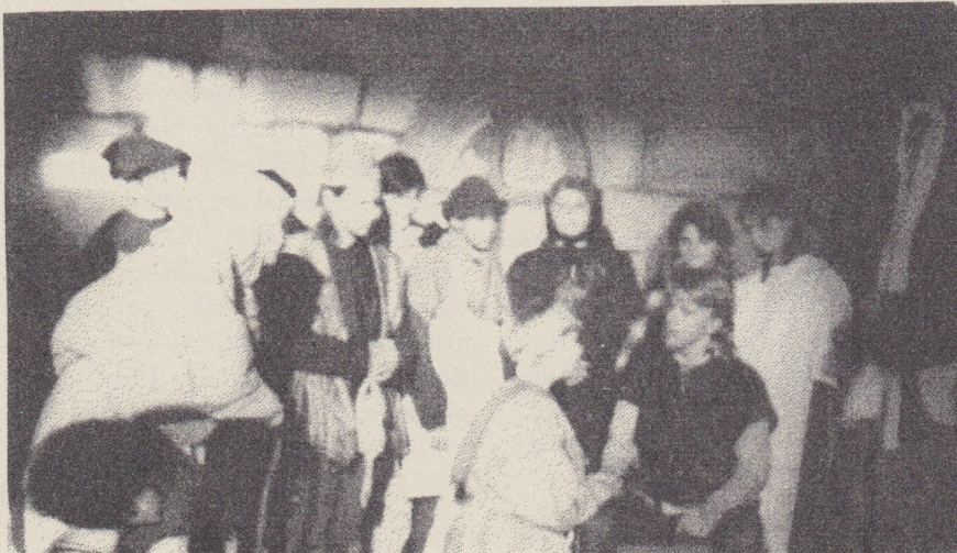
In the last scene, Gwenny tells Robin how proud everyone is of him.

November 4, 6, and 7 were the three main performances. They went very well. The cast was very pleased with the audiences reaction. The performance on Monday was the largest. The cast and crew are ready for a break but unfortunately they will be starting another play very soon.