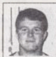
Jason Nyberg Sports Column