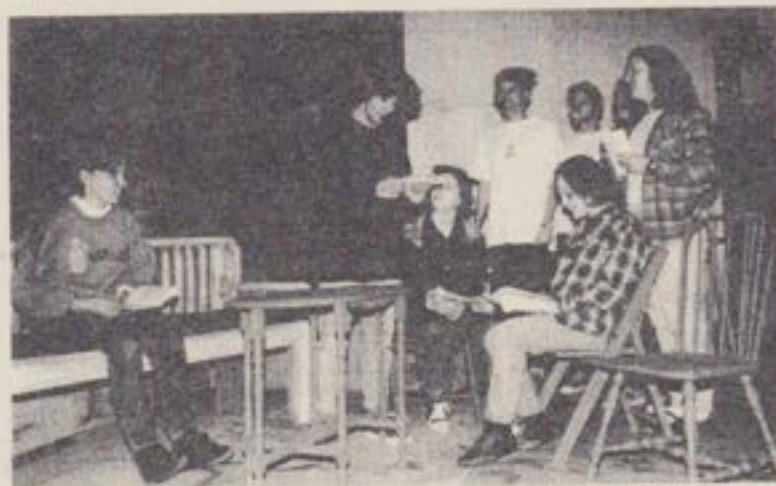
The cast of Anne Frank during practice.

If you get a chance you should attend the play. It is very moving. Just do not forget your kleenex.