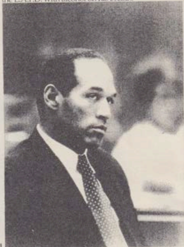
Right: O.J. Simpson At His Trial