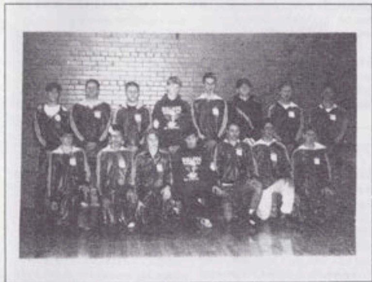
The Harrisburg High School Wrestling Team.

Wrestling is a sport of endurance, strength, and speed, one false move could be the end. Although it is an individual sport of man vs. man it is also a sport where each teammate must cheer each other teammate on.